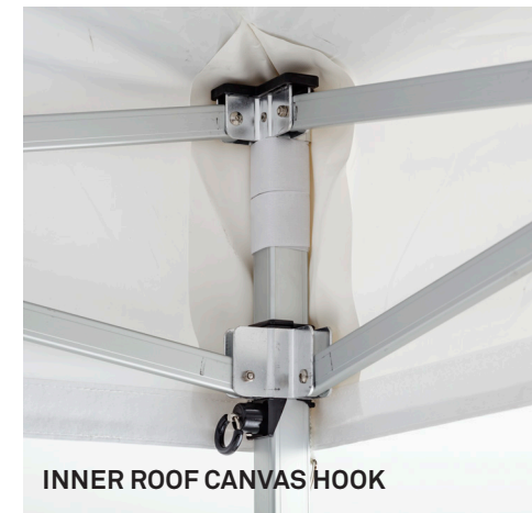
INNER ROOF CANVAS HOOK