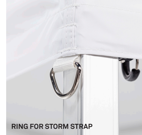
RING FOR STORM STRAP