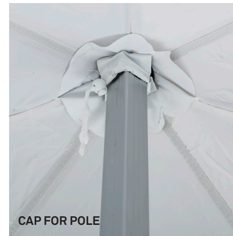
CAP FOR POLE